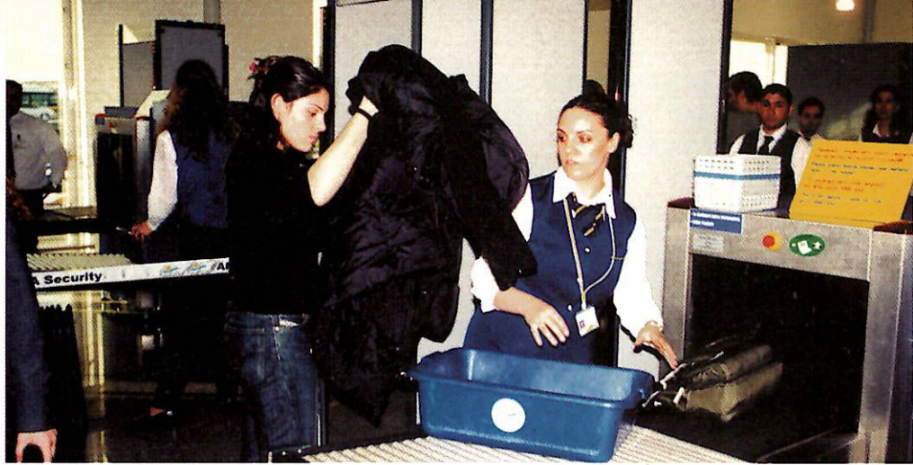
Passenger screening points at AIA are operated by a consortium (3D/ICTS/Wackenhut)

various options in respect of explosive trace detection equipment.